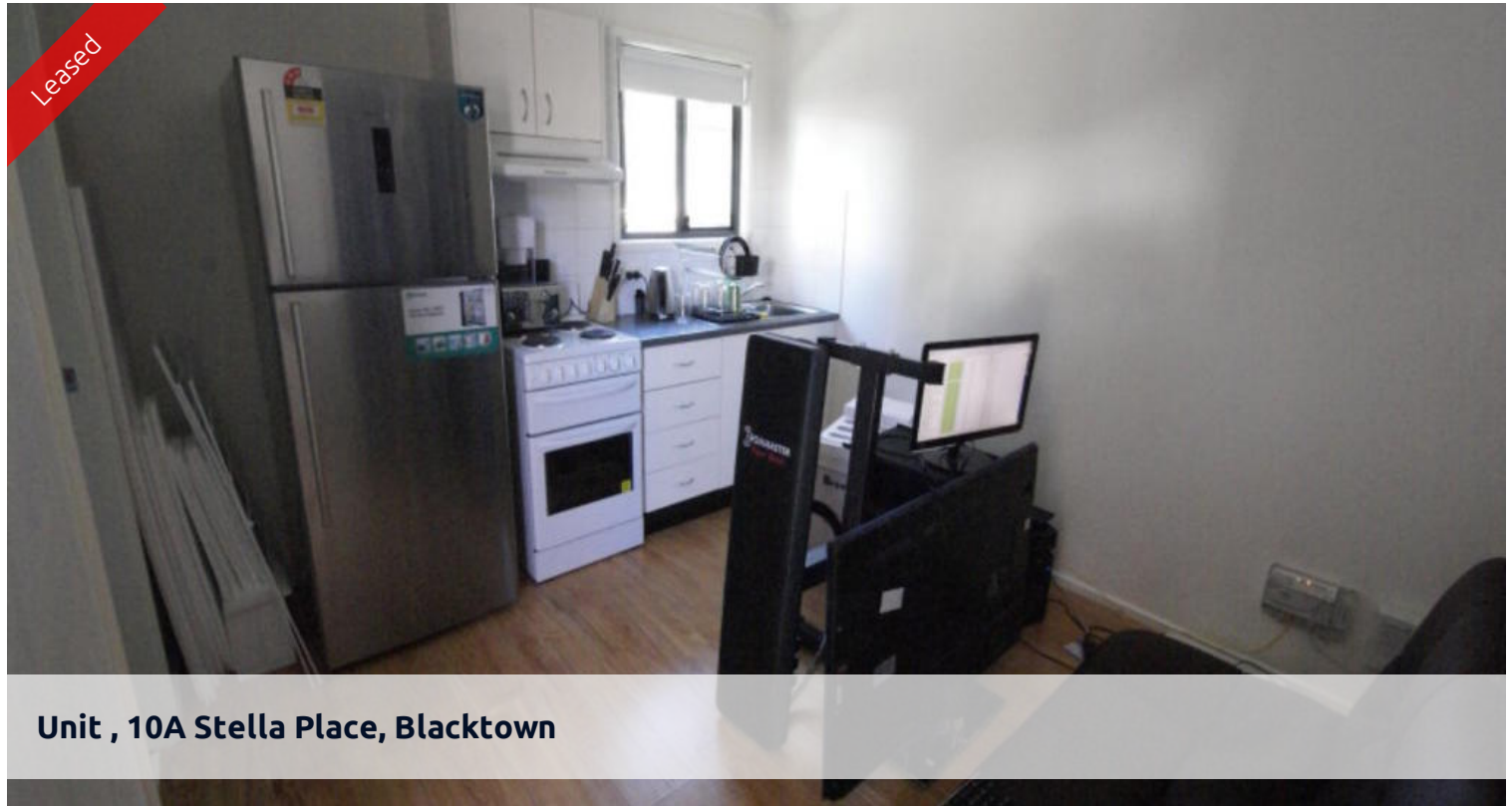
Unit , 10A Stella Place, Blacktown